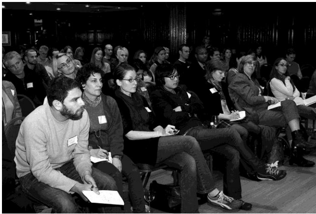
The audience at the National Press Club presented by the ASPP/South Chapter

The photographic career has changed. One needs to be more imaginative in finding that first job or maintaining a photographic business than was necessary as little as ten or twenty years ago. If a shooter possesses good business sense and the ability to research situations that require specific skills and abilities, making a living as a still photographer is still possible.